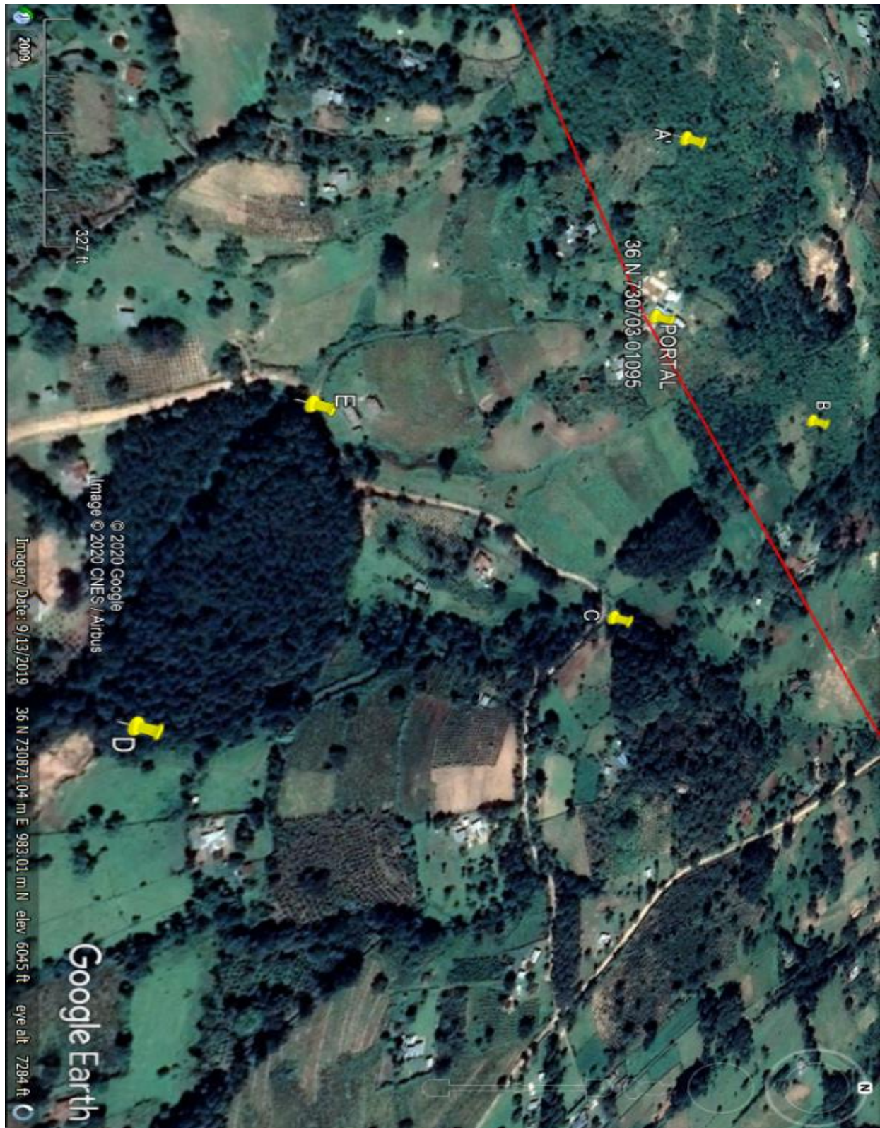
Attachment 1: Actual Site location